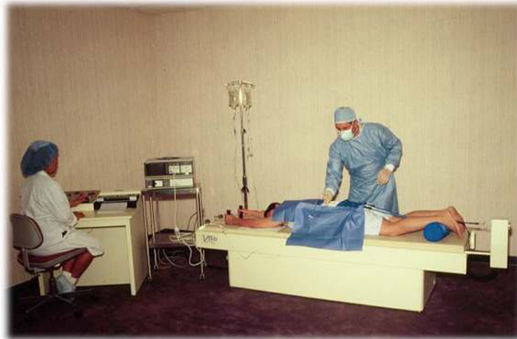
Fig. 1. Photograph illustrating the equipment and the position of the patient as the system is activated. The caudal end of the Table extends, applying tension to the pelvic belt. Upper body movement is restrained by having the patient grasp the handgrips. A graph of the tension applied is plotted by a chart recorder on the control console and the intradiscal pressure readings are entered on the same graph at the apex of each distraction curve.

The patient was prepared and a cannula was inserted under local anesthesia into the nucleus pulposus of the L4-5 intervertebral disc, using anteroposterior and lateral fluoroscopy to position the end. With the cannula in place, the patient was moved to a VAX-D table. The VAX-D equipment* is routinely utilized in our non-surgical treatment program for patients suffering from low-back pain. The equipment consists of a split table design with a tensionometer mounted on the caudal, moveable section. The patient lies in a prone position and grasps handgrips to restrain movement of the upper body, which is supported on the fixed section of the table (Fig. 1 ).