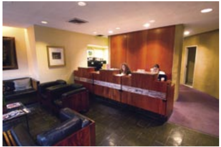
Manhattan Spine & Sports Medicine's front office reception area and waiting room.

an aggressive active rehabilitation therapy program. We also offer orthopedic rehabilitation that is overseen by a trained orthopedist. Staff members supervise patients until they are able to perform the exercises on their own at home. Orthopedic rehabilitation is a fabulous luxury here."