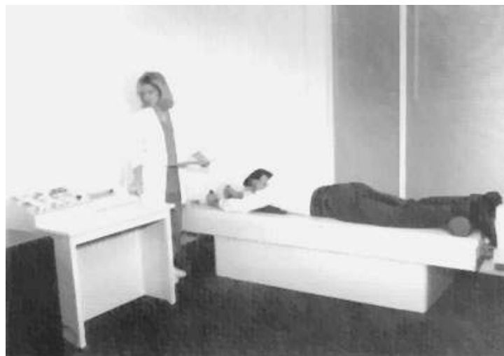
Figure 1: Patient undergoing treatment on the VAX-D Therapy Table

The blood supply to the nerve roots of the cauda equina is sensitive to compression. Even at pressures of only 5-10 mmHg, the flow in over 20% of the venules was completely stopped (6). Flow in all the capillaries stopped at pressures between 20 and 50 mmHg. A pressure of 30 mmHg is slightly less than one pound per square inch, so solute transport is easily reduced. Even vertebral distractions (increased separation) of 1 or 2 mm per disc would reduce ligamental redundancy and help to restore canal/foraminal patency, reduce venous congestion and increase axoplasmic flow. Furthermore, the effects of lumbar spine lengthening may be sustained for a period of time after lumbar distraction has been stopped.